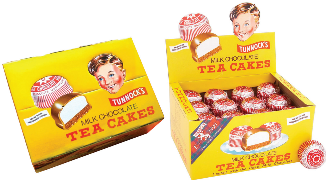
Packaging display box