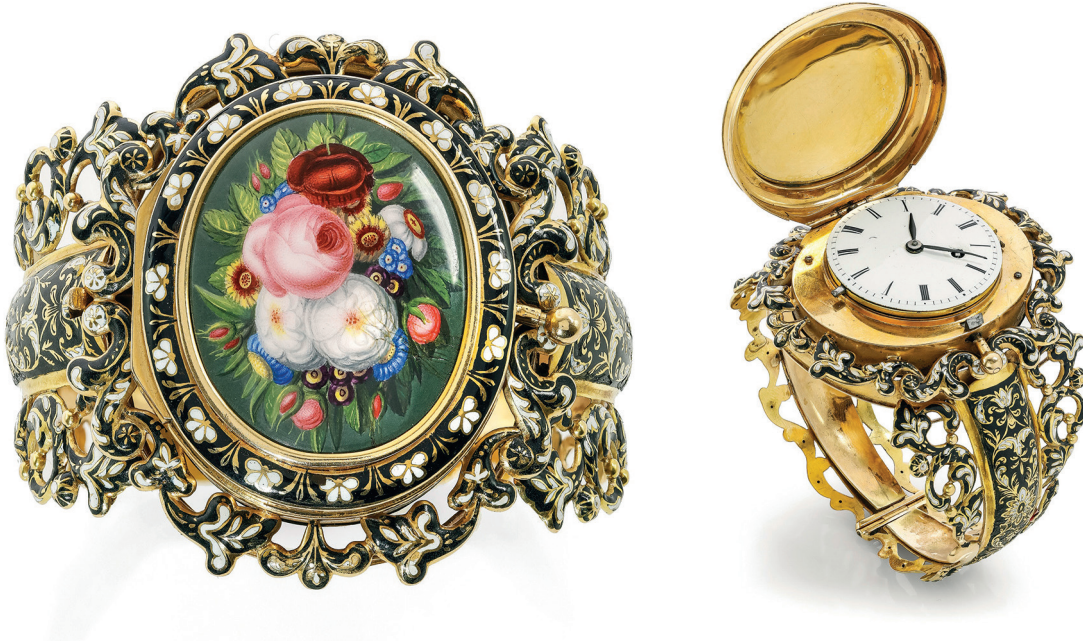
Gold and enamel bracelet with concealed watch (c.1830) by Moricand and Desgrange

9. Analyse the following elements of this jewellery design