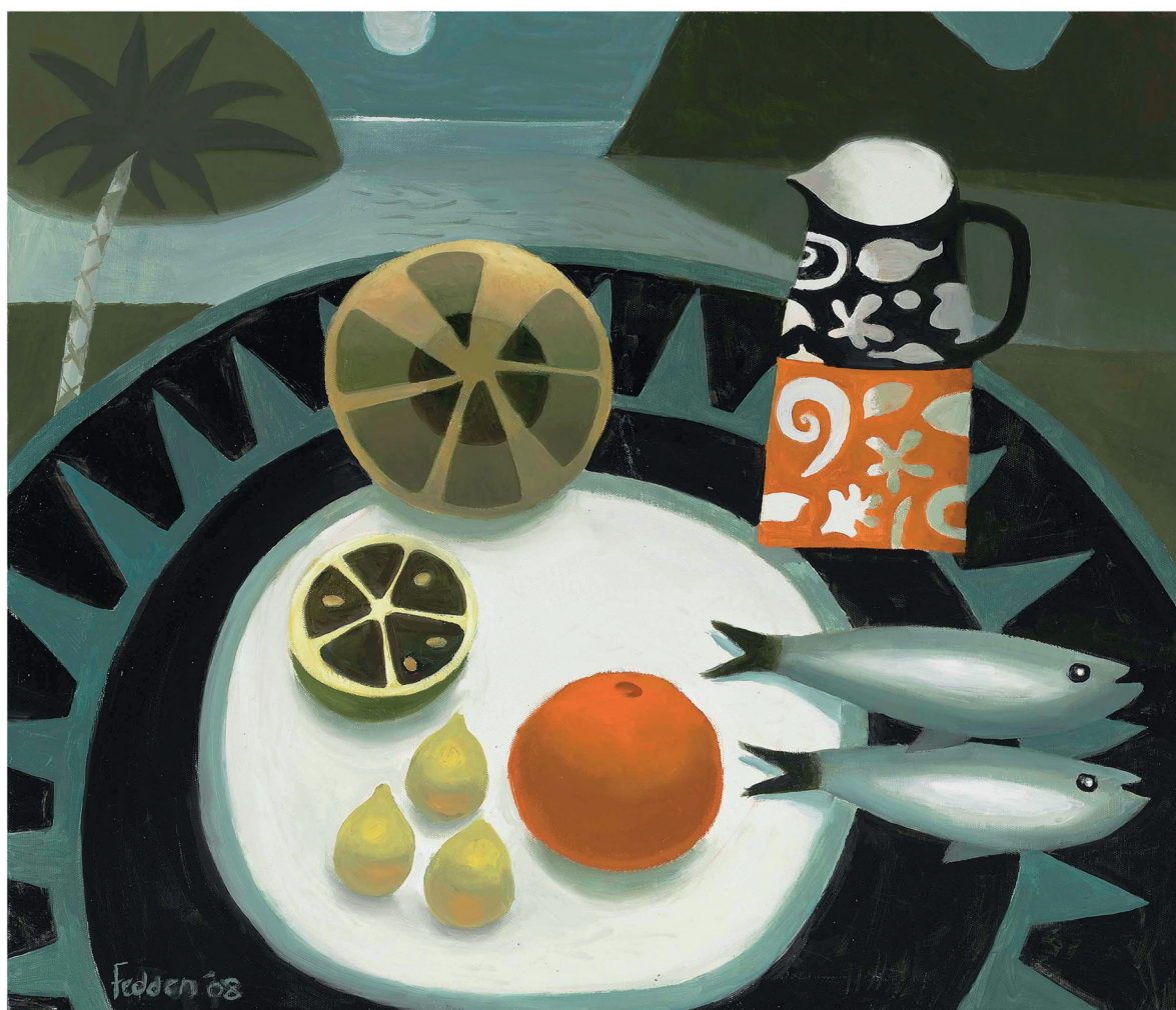
Charlotte's Jug (2008) by Mary Fedden