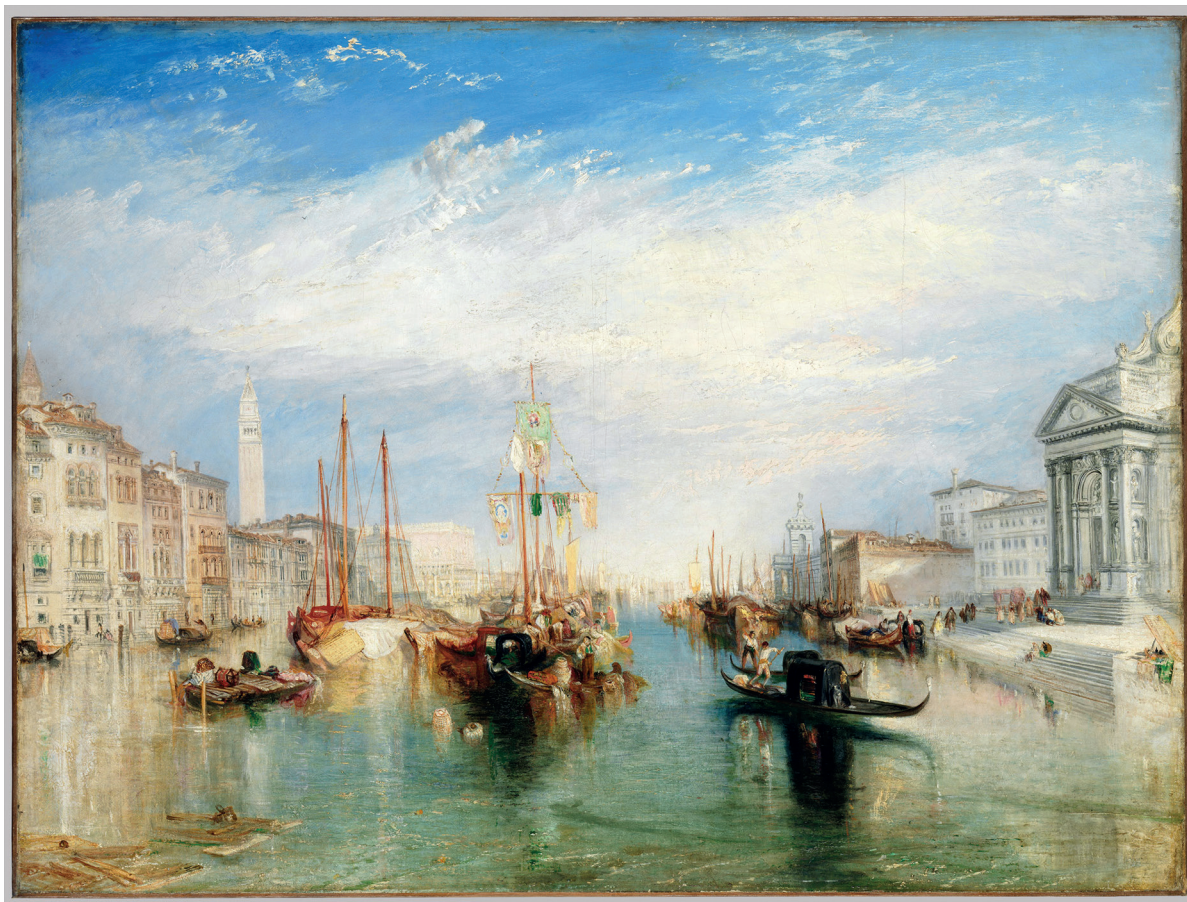
Venice, from the Porch of Madonna della Salute (c.1835) by JMW Turner