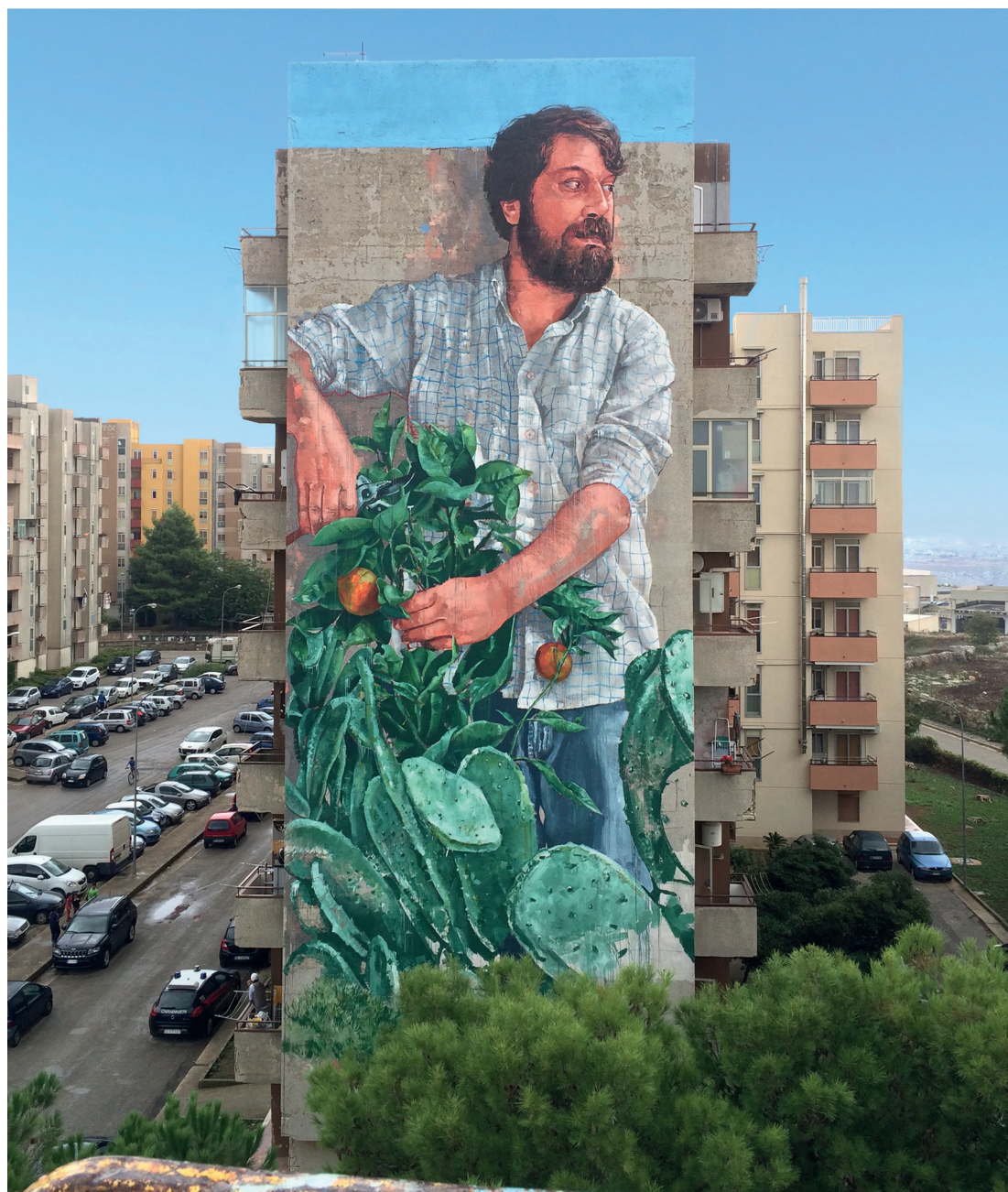
The Gardener (2016) by Fintan Magee Acrylic paint on concrete, Ragusa Italy

5. Analyse the following elements of this artwork