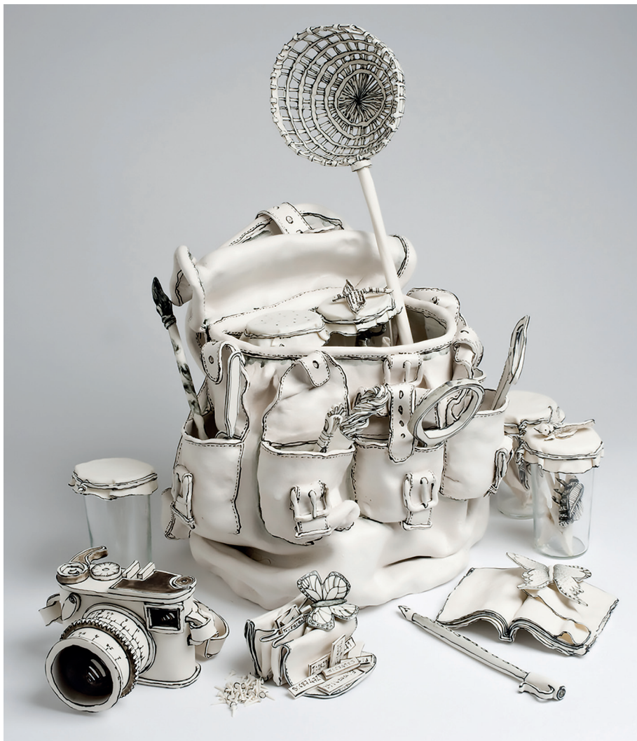
Rummage and Gather (2013) by Katharine Morling Earthstone clay, white porcelain clay and black ink (60 x 40 x 30 cm)

2. Analyse the following elements of this ceramic sculpture