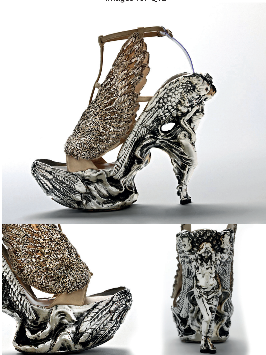
Angel Wing Shoes (2010) by Alexander McQueen

Materials: leather, resin 1 and silver thread