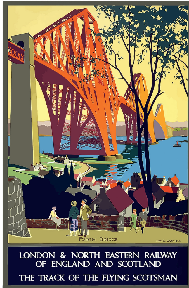
Forth Bridge Poster (c. 1930) by H G Gawthorn London and North Eastern Railway Advertisement

8. Analyse the following elements of this poster design