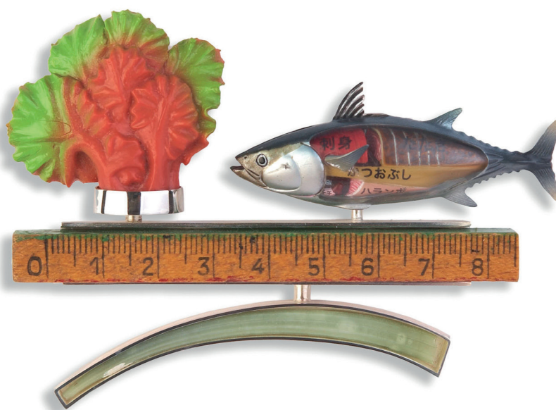
Great Barrier Brooch (2010) by Jack Cunningham Materials: silver, wood, shell and plastic (10 x 7 x 2 cm)

11. Analyse the following elements of this jewellery design