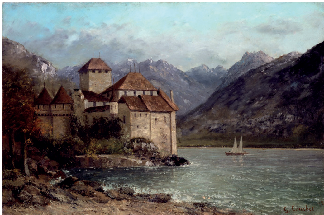
Le Château de Chillon (c. 1874–1875) by Gustave Courbet Oil on canvas (54 x 65 cm)

5. Analyse the following elements of this painting