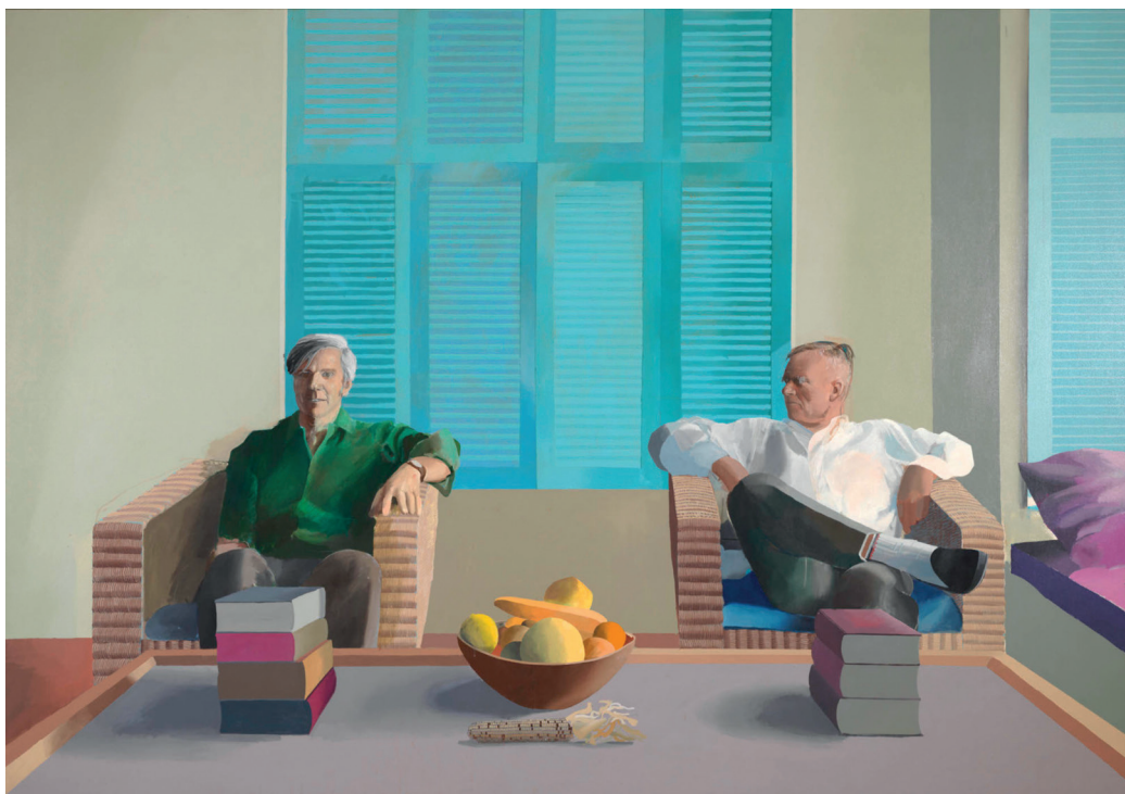
Christopher Isherwood and Don Bachardy (1968) by David Hockney Acrylic on canvas (212 x 303 cm)

6. Analyse the following elements of this painting