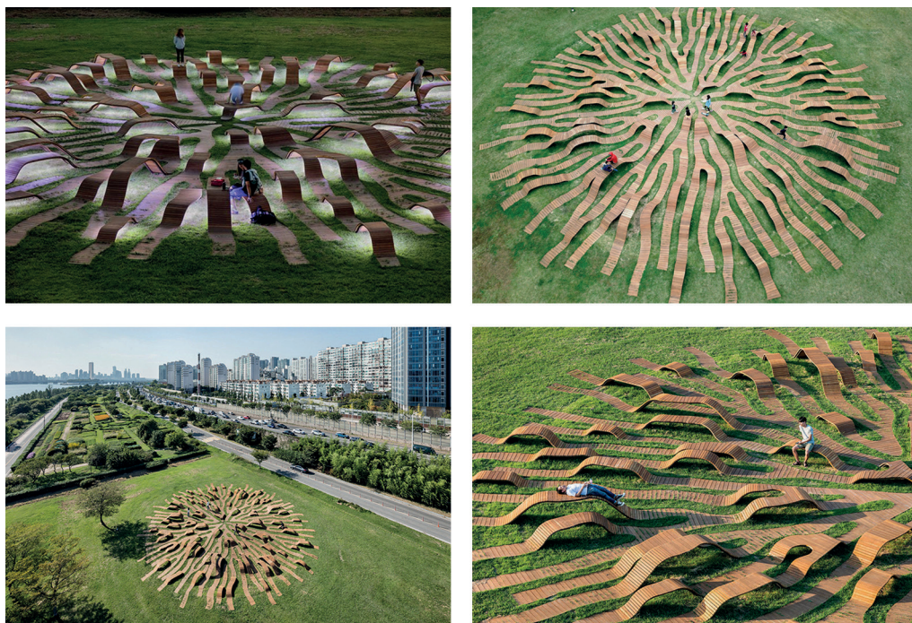
Root Bench by Yong Ju Lee (c. 2018)

Materials: metal frame and concrete footing with a wooden decking (diameter 30 m)