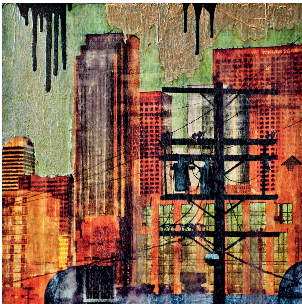
Urban View (2013) by Anyes Galleani Parchment paper and paint on wood (61 x 61 cm)

3. Analyse the following elements of this artwork