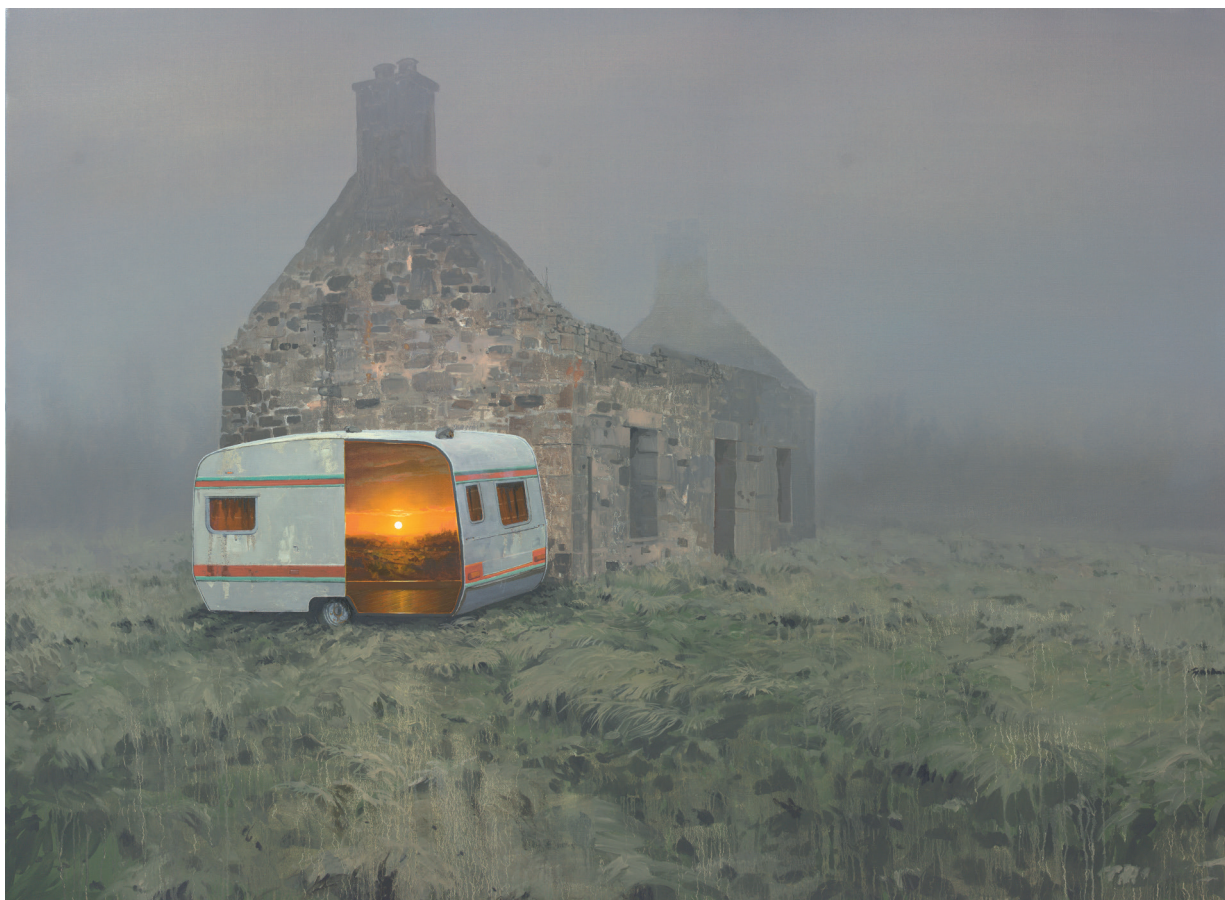
Merlin (2016) by Andrew McIntosh oil paint on linen (150 x 110 cm)

5. Analyse the following elements of this painting: