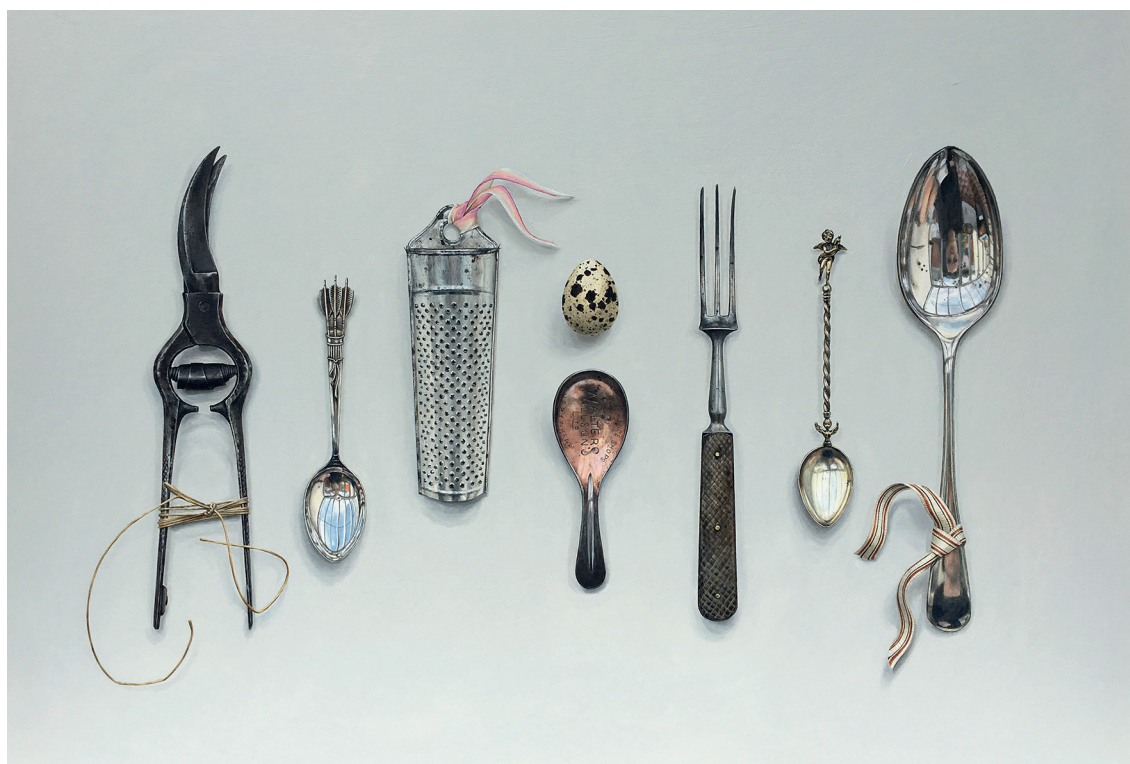
Kitchenalia (2019) by Rachel Ross acrylic paint on panel (54 × 80 cm)

3. Analyse the following elements of this painting: