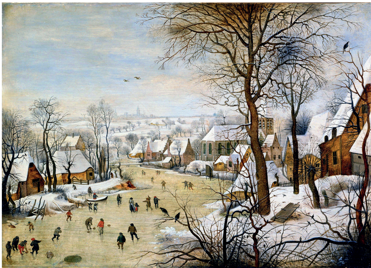
Winter Landscape with Skaters and Bird Trap (1565) by Pieter Bruegel the Elder oil paint on panel (37 × 56 cm)

5. Analyse the following elements of this painting: