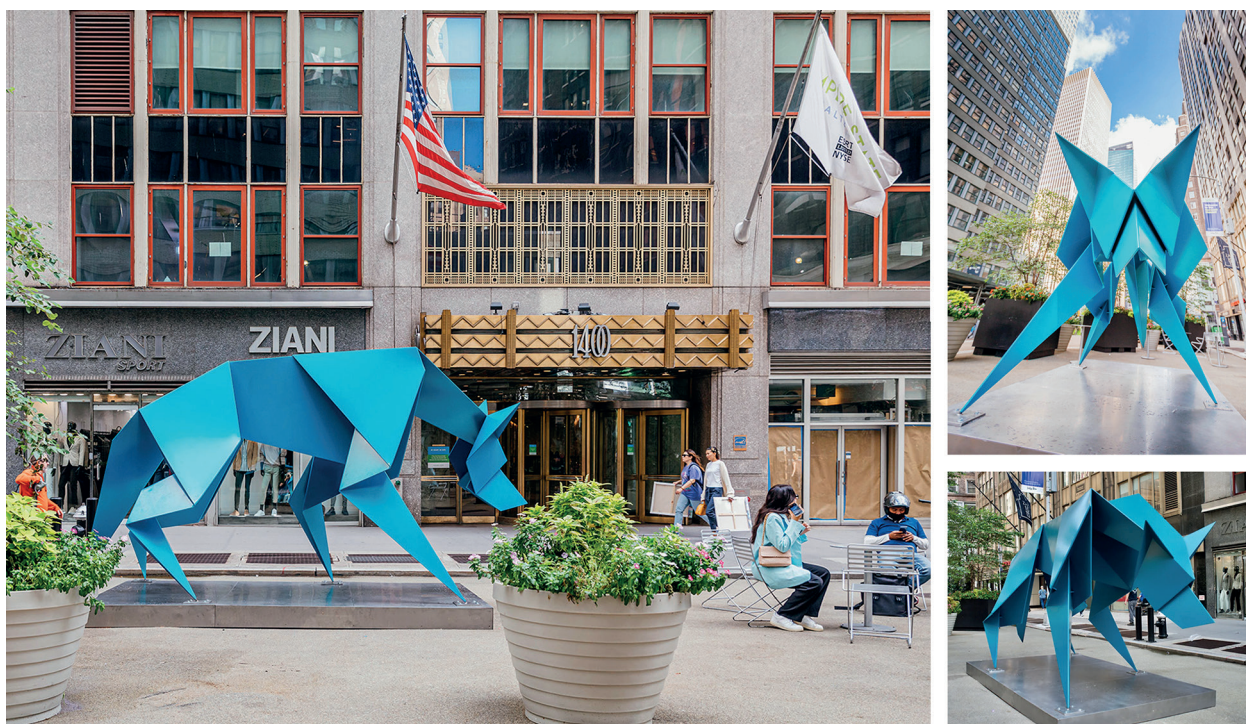
Coyote, Stalking (2015) by Gerardo Hacer weatherproof, colour coated steel (248 × 198 × 447 cm)

4. Analyse the following elements of this sculpture: