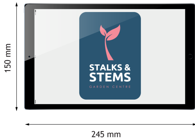
Tablet size — 8 mm thick